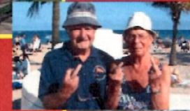
Malmesbury Bowls Club Founded 1908 Oldest in Wiltshire