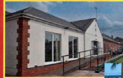
Cirencester Bowling Club Founded 1930