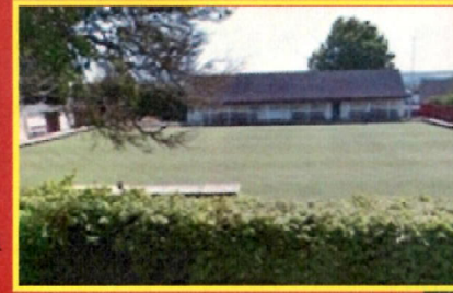
Wooton Bassett Bowls Club Founded 1927